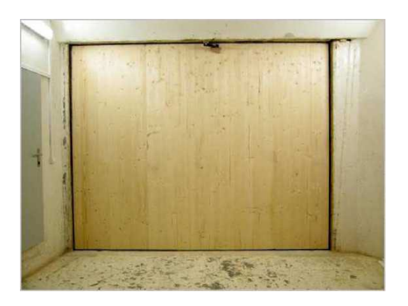
End of report